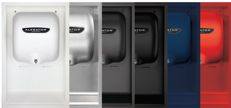
Dryer Sold Separately

2 Special paint colors include white, raven black, red baron and graphite. Custom paint colors are also available and require a minimum order of 5 or more. Call Excel Dryer for custom paint color options and details.