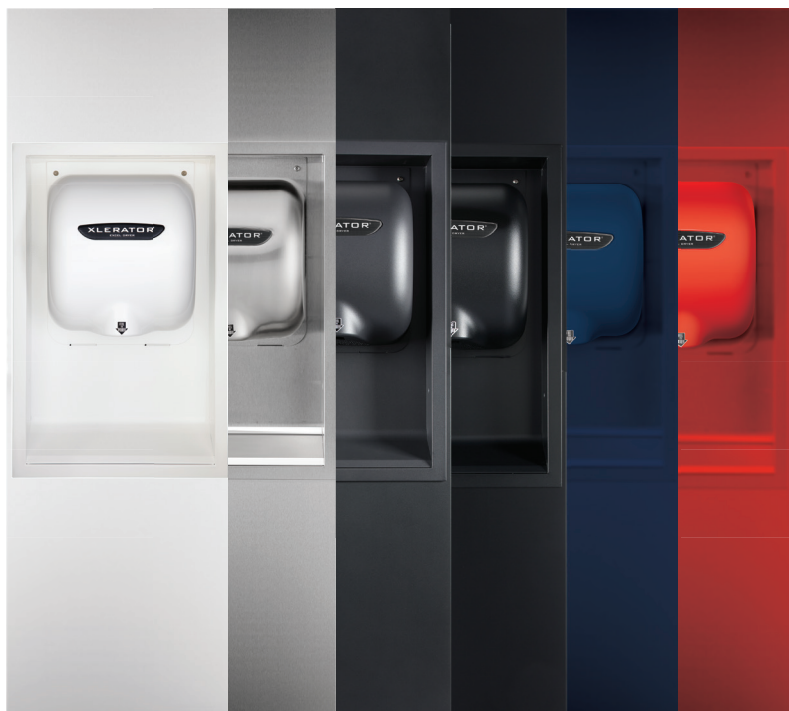
Dryer Sold Separately